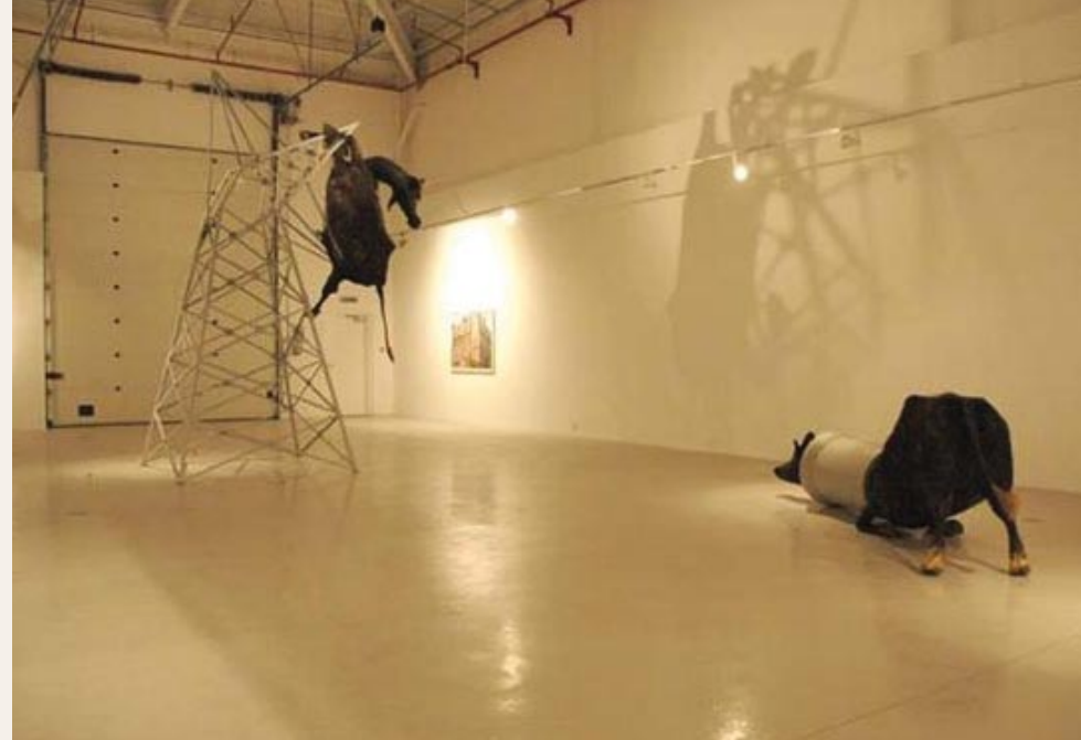
High Rise Huma Mulji