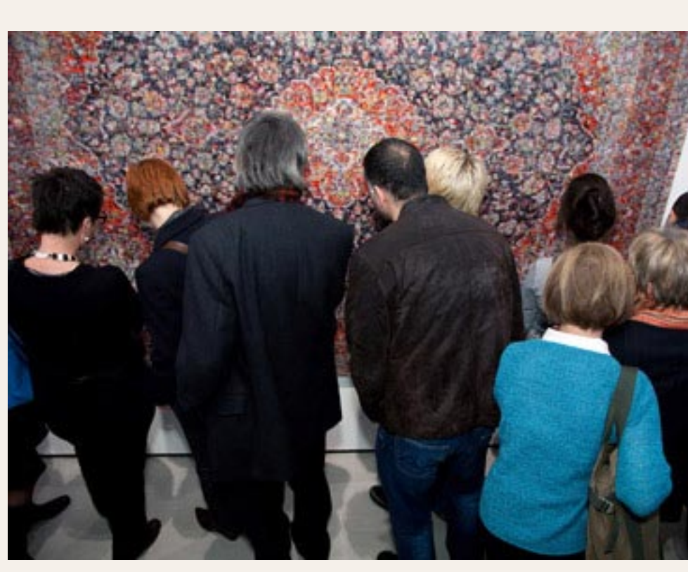
Red Carpet Rashid Rana, Vienna