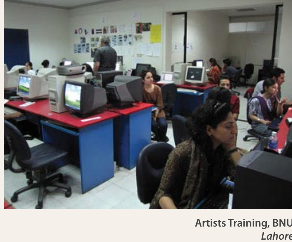
Artists Training, BNU Lahore