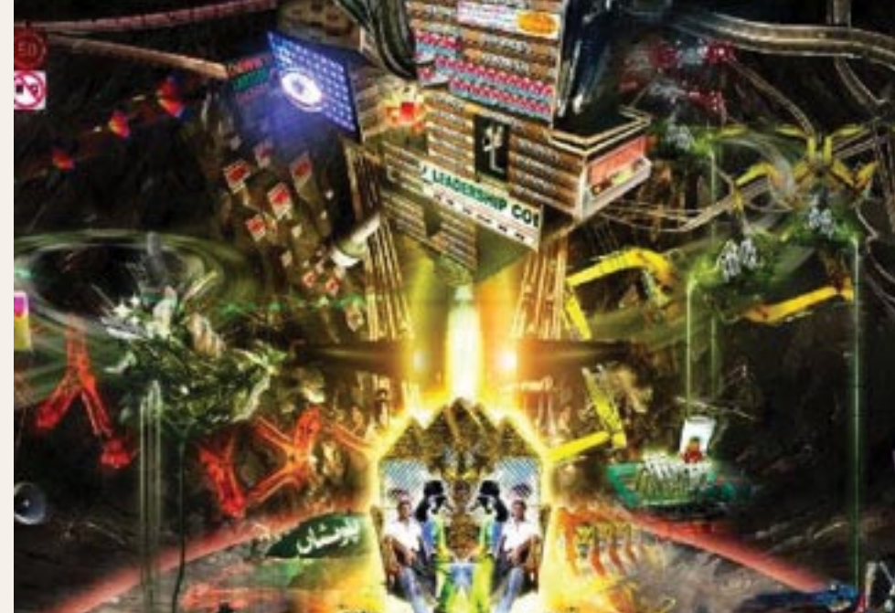
Divine Invasion Mehreen Murtaza

http://www.vaslar.org/text%20folder.2008-08-26.8805113797%20folder.2009-03-18.9794193219%20Genocchio%20Art%20Pakistan%20Art%20in%20America%20Cpdf