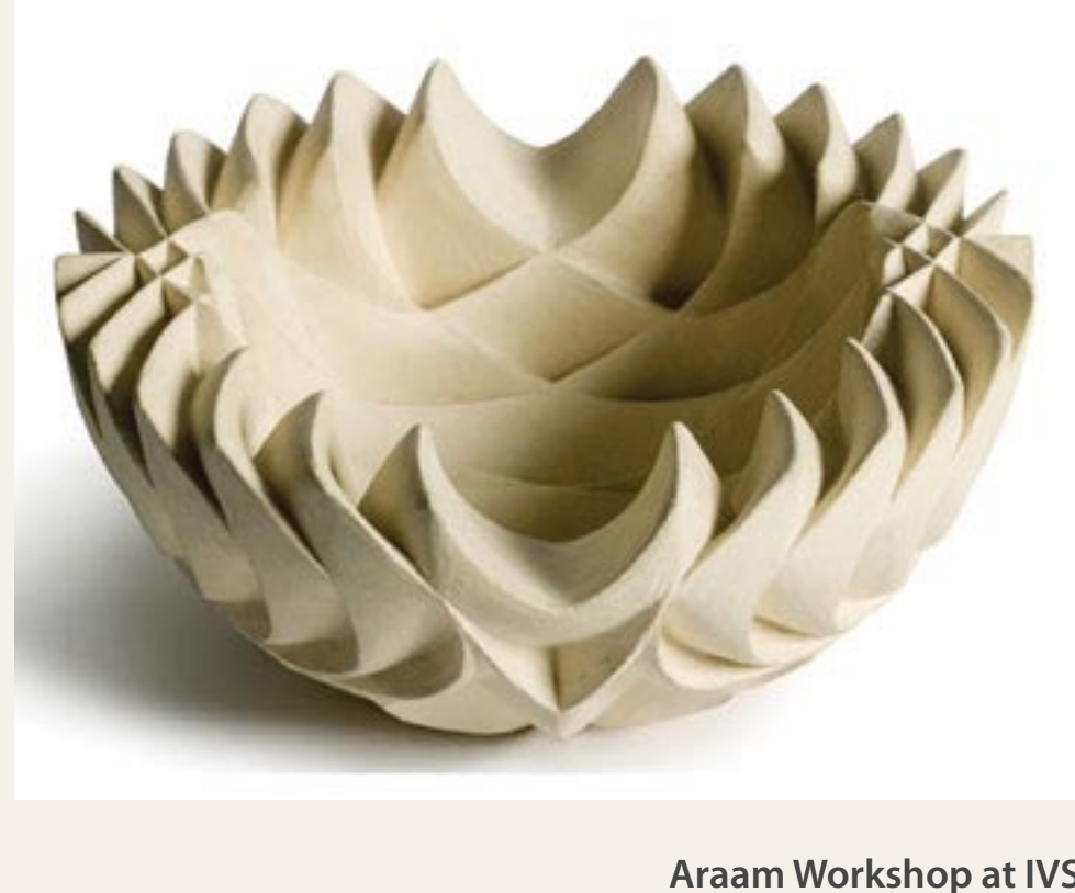
Aaram Workshop at IVS Halima Cassell, Karachi