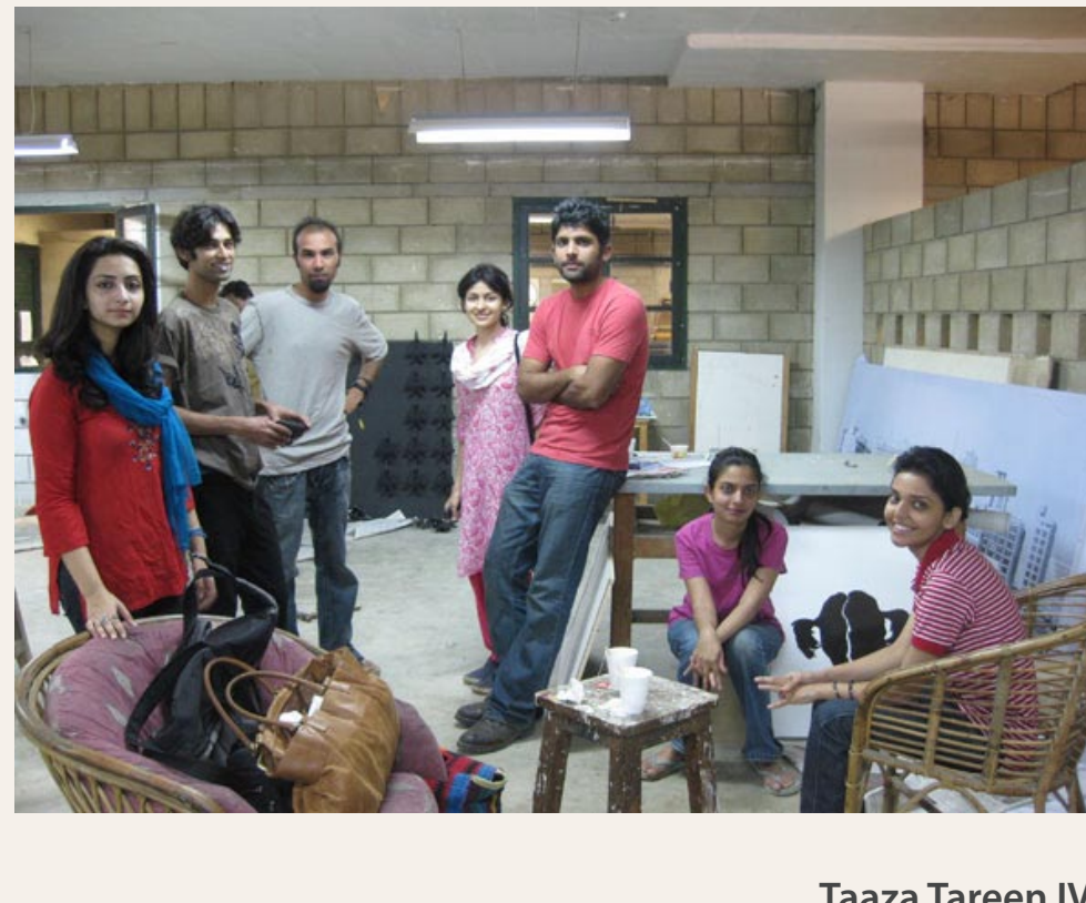
Taaza Tareen IV Artists in their IVS Studio, Karachi